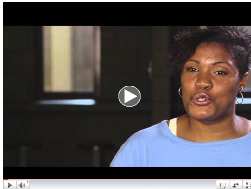
Prison of Peace: A Peacemaker's Journey