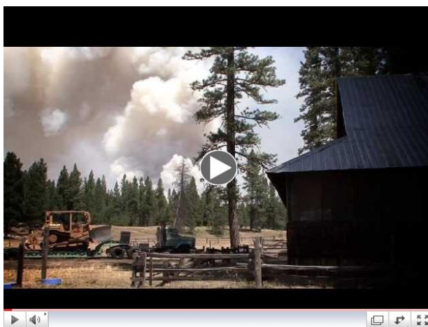
Lions Provide Relief for Yosemite Rim Fire

It was a joy to be able to play a small part in this wonderful Lions success story. Later in the week, LCI sent a video crew to film the kitchen effort and there is a heartwarming 3-minute video being highlighted on the Lions Clubs International website.